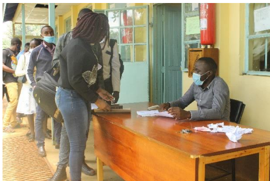
First-year students during the registration process.

Subsequently, he said that the first-year students were going to stay on Campus for a short period then go back home with the exception of those in technical programmes.