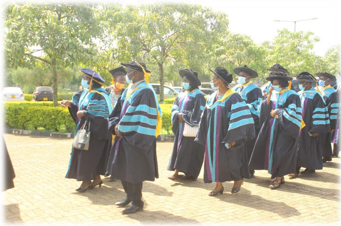
The academic procession headed to the graduation square for the Ag. Vice Chancellor's and Ag. Deputy Vice Chancellors' address to first years.

“We want to see you emerge as job creators and global leaders,” he said.