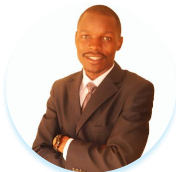
Shiundu Wilberforce Photographer