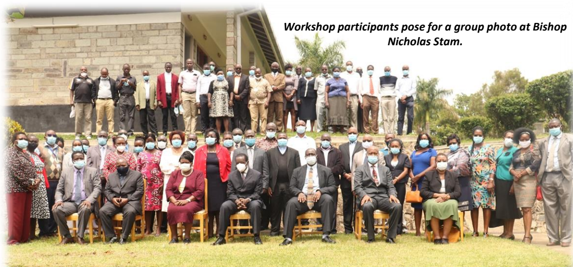
Workshop participants pose for a group photo at Bishop Nicholas Stam.