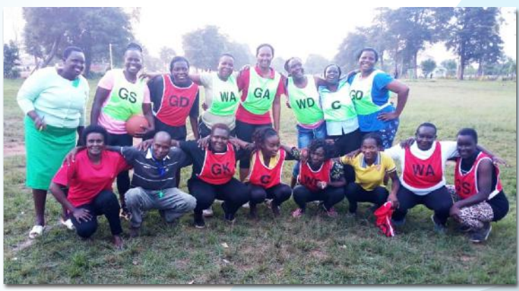
KUSU (Green) and KUDHEIHA (Red) Netball Teams