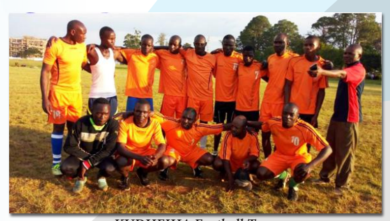
KUDHEIHA Football Team