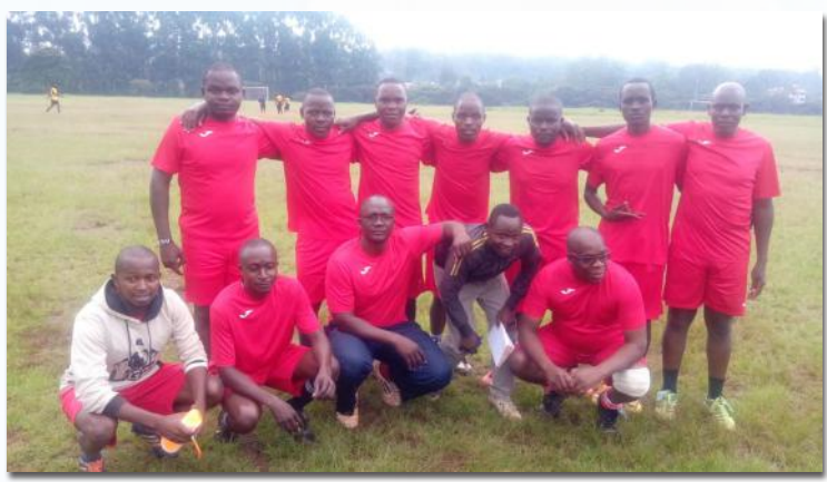
UASU Football Team