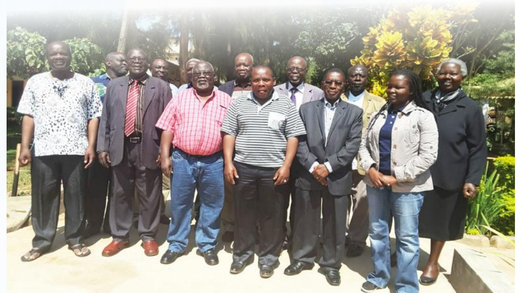
MMUST Professors during the Professors Retreat at Farmview Hotel, Busia

MMUST has eighteen (18) professors comprising of two female professors and sixteen male professors. The professors have a Professors Forum where they discuss on issues facing the University and how best they can play a role in growing the University.