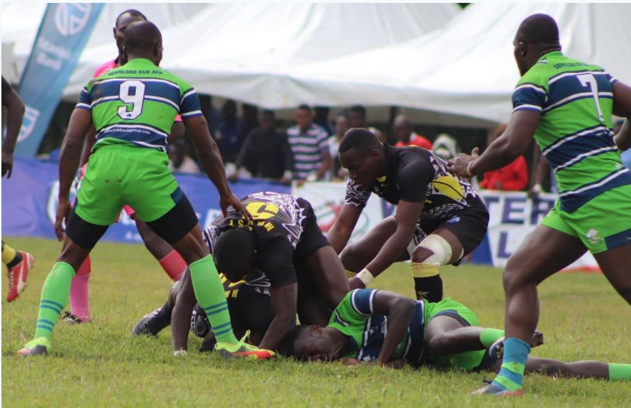
Above: KCB defend against a charging MMUST RFC forward line